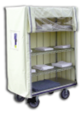
Round Style Drape Cover, fits beautifully

Square Style Drape Cover with Transparent Front Flap: allows viewing of inventory, not: